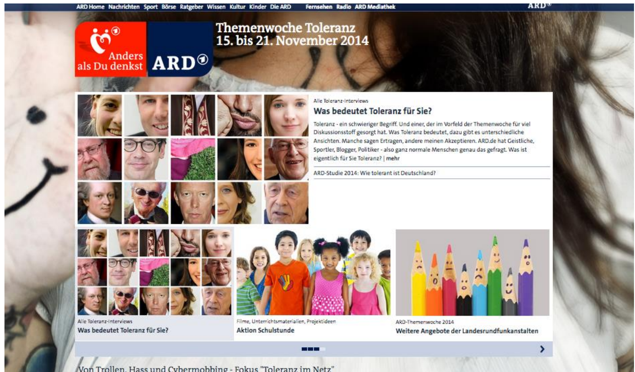
Fig. 6 – ARD Tolerance Week – ARD Themenwoche Toleranz – screenshot of the web page

In this context, the media undertook the role of instructing, showing tolerance to be the “rational,” “civilized” way of responding to people or phenomena deemed outside the social norm, while at the same time in individual media examples showing that even tolerance has and should have its limits. 75 Not only in the media channels, a school week on tolerance ( Aktion Schulstunde ) was organized parallel to the media week. All over Germany, primary school children and their teachers were invited to “deal with the different facets of tolerance,” because “children who learn early to be tolerant will profit not only in school, but in all life situations.” 76 The proclaimed objective of the school week was to offer tolerance as the response of choice in cases of contact with difference, as stated in the accompanying text: