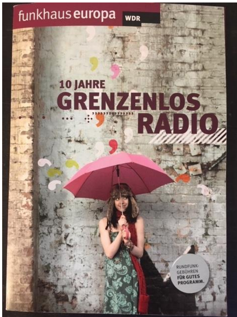
Fig. 2 – 10 Years Boundless Radio – 10 Jahre grenzenlos Radio – Funkhaus Europa brochure 2009

this person is of another origin, this leads to an especially high authenticity with our audience. If you want to put it in journalistic terms, it often brings another point-of-view into the reporting. Sometimes we do it differently on purpose and send a Turkish reporter into a Croatian pub or a German reporter into a Turkish coffee house, because when you are not so near the culture, you notice new and different things. (translation from German by the author)