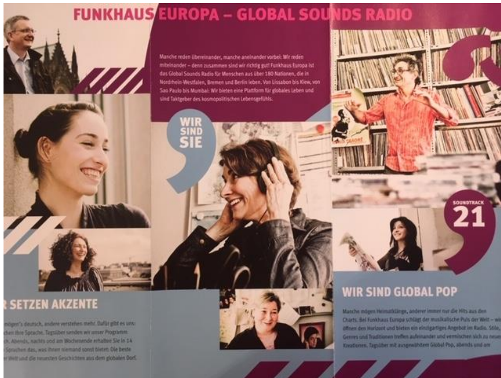
Fig. 4 – Global Sounds Radio – Funkhaus Europa Brochure

“We are you,” “We speak your languages,” “We put accents,” and “We are Global Pop.