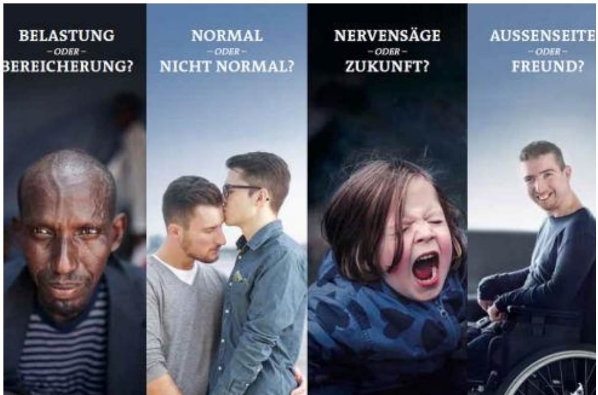
Fig. 7 – Posters of the ARD Tolerance Week