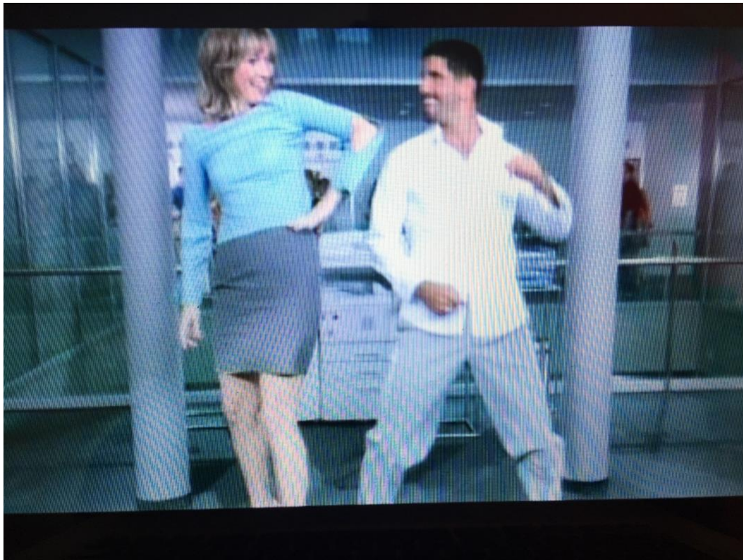
Fig. 3 – Scene from the Funkhaus Europa commercial, 2003

The affective side of multiculturalism is also stressed in the reporting on music, the aspect most easily consumed via radio waves. Two video commercials from the time illustrate this, the first one shown in movie theater previews. 41 The commercial focuses on a bi-national couple of presenters (blond young woman, young man of Turkish origins) dancing, followed by sequences of people of various origins, skin colors, and professions in their everyday situations in visually recognizable settings of the towns of Western Germany, also dancing to Funkhaus Europa music.